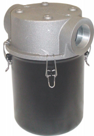
CT-851/850 2" & 2 1/2" FPT