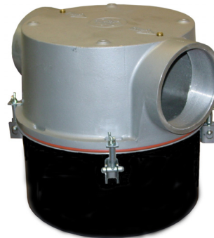
CT-275P/274P 5" & 6" FPT