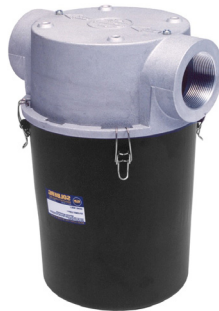
CT-235P/234P 3" & 4" FPT