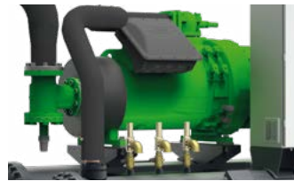
High efficiency screw compressors designed for R513A refrigerant gas.