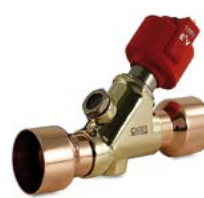
Electronic expansion valve.