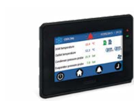
Latest-generation touch screen user terminal.