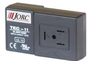
Private labelling options