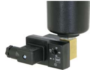
Inline installation under compressed air filters