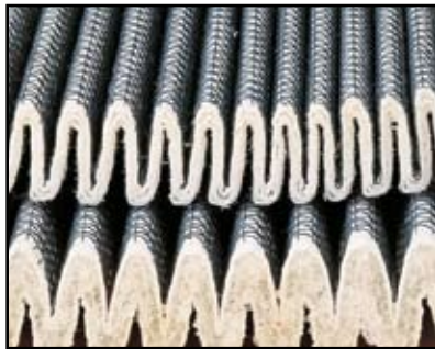
Photo above shows 'dry' Par-Gel filter media and the same media swollen with absorbed water.

The Par-Gel filter media is a highly absorbent copolymer laminate with an affinity for water. However, hydraulic or lubrication fluid passes freely through it. The water is bonded to the filter media and forever removed from the system. It cannot even be squeezed out.