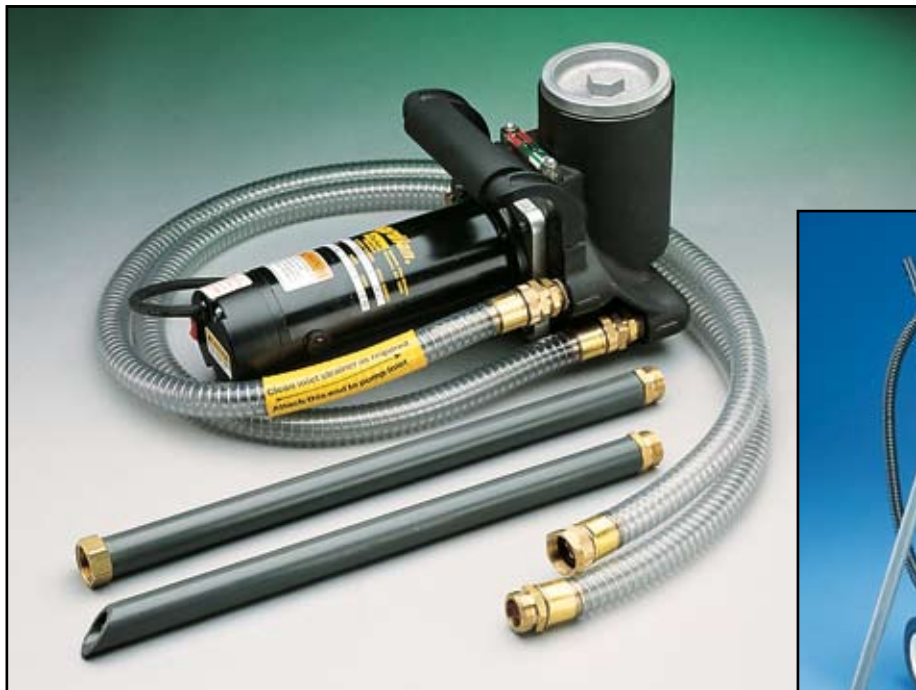
Guardian® Portable Filtration System