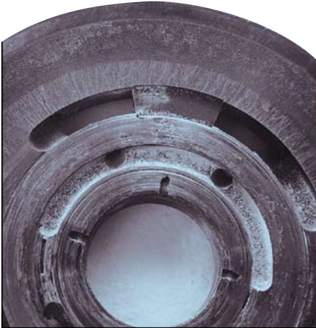
Typical results of wear due to presence of particulate and water contamination.

Condensation is also a prime water source. As fluid cools in a reservoir, temperature drop condenses water vapor on inside surfaces, which in turn causes rust. Rust scale in the reservoir eventually becomes particulate contamination in the system.