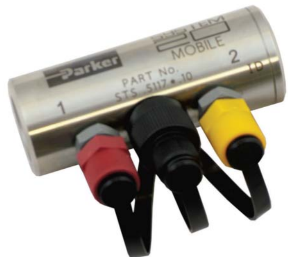
2 sizes of System20 Inline Mobile Sensors are available